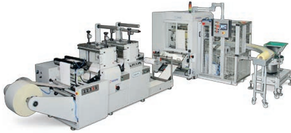
BLANK LABELS FABRICATION